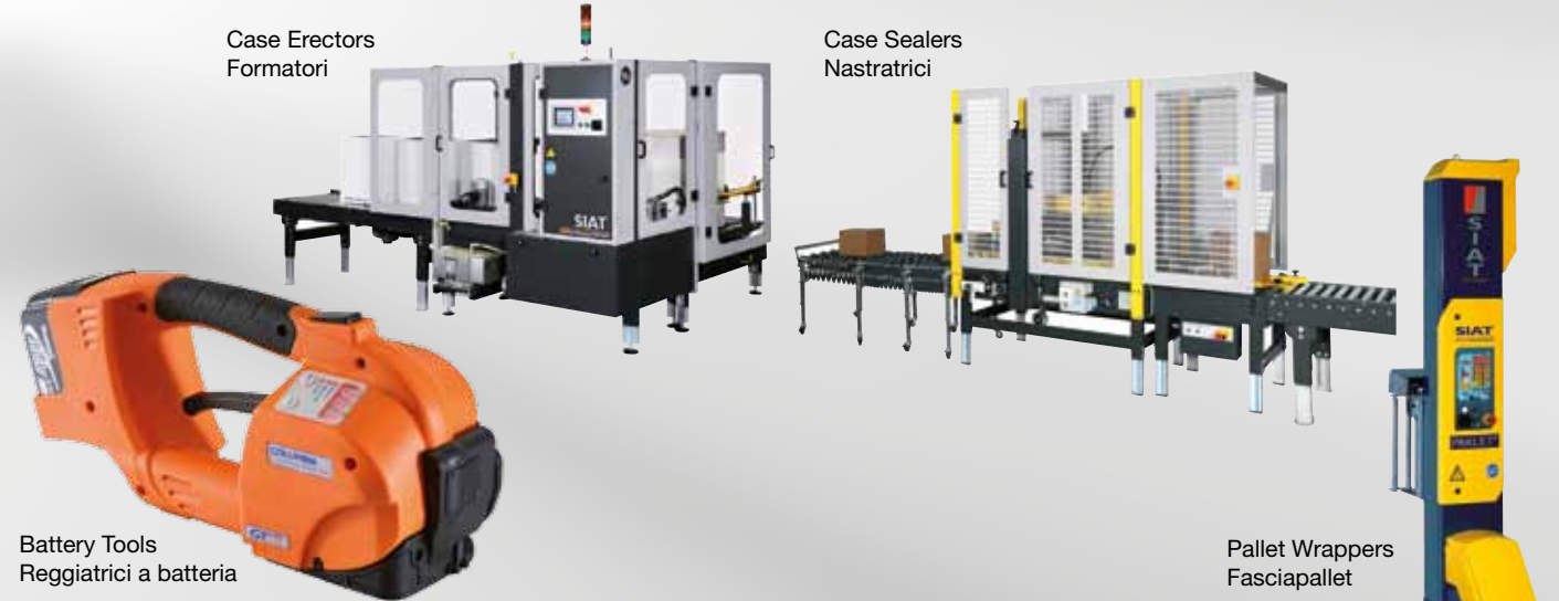
Battery Tools Reggiatrici a batteria

N/A = Non applicabile | Not applicable | Pas applicable | Unanwendbar | No aplicable